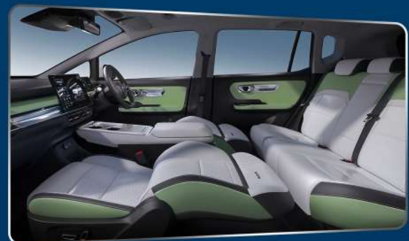
Reclining Seat (1.8 m Super King Size Bed)