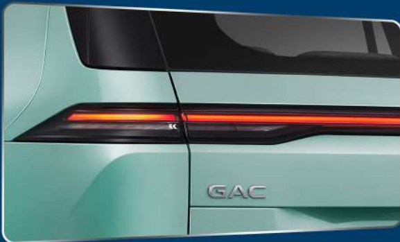
Skyline Run-through Taillights