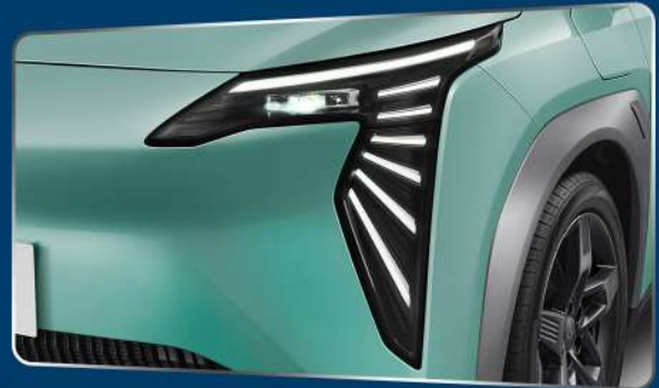
Angel's Wing Headlamps